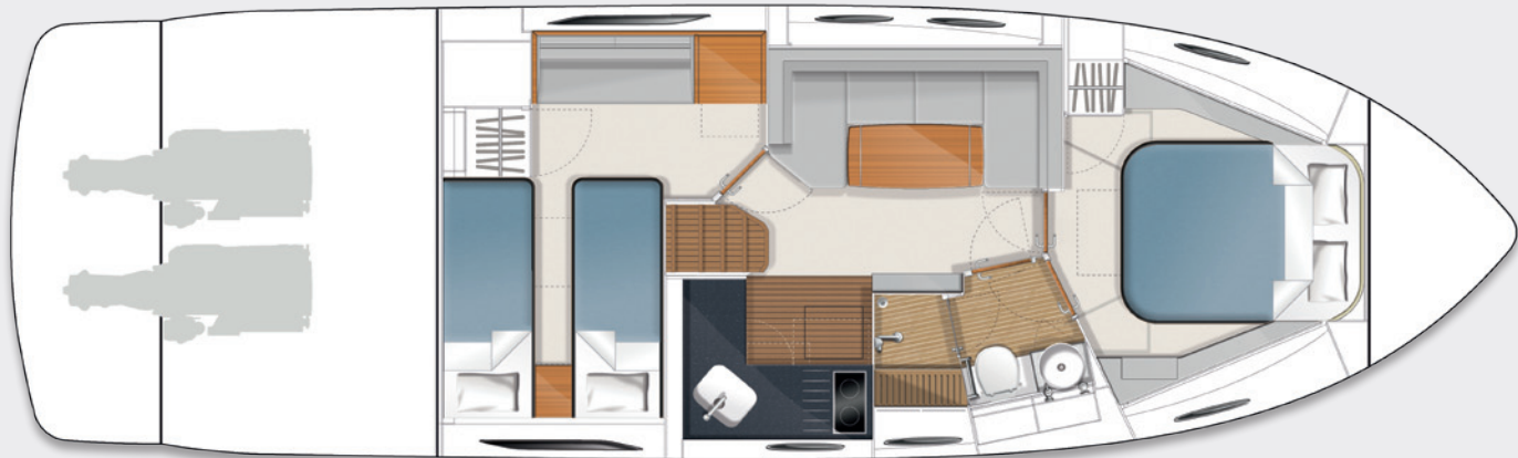
LOWER ACCOMMODATION LAYOUT