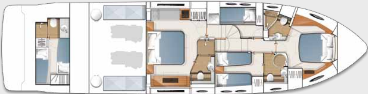
Lower Accommodation Layout