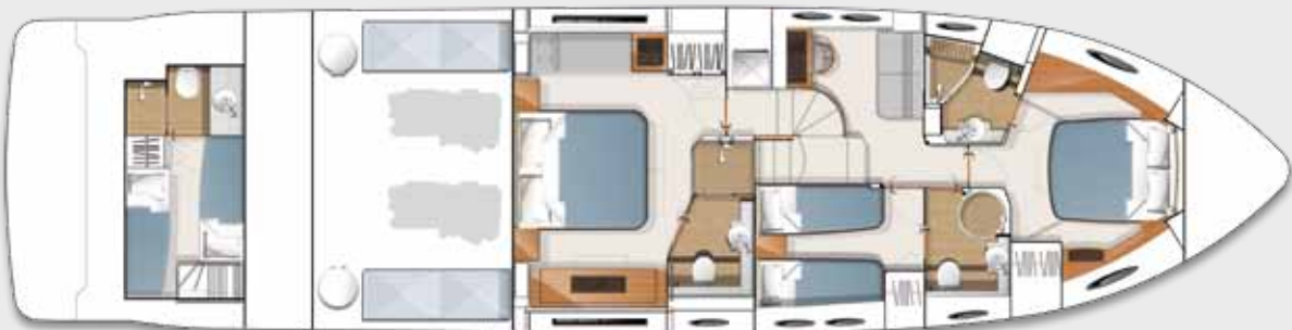
Lower Accommodation (Optional Study Layout)