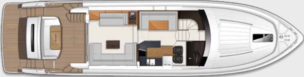
Upper Accommodation Layout